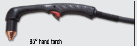
85° hand torch

(for more torch options, see www.hypertherm.com )